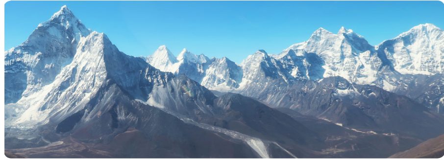
Himalayas mountain range

A mountain is a large, raised part of the Earth's surface. A mountain's highest point is called its peak or summit. Mountains are at least 610m in height. A mountain range is a chain of mountains that are close together. They are usually arranged in a line connected by ridges.