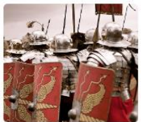
Emperors and Empires