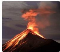
Rocks, Relics and Rumbles