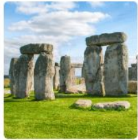
Through the Ages