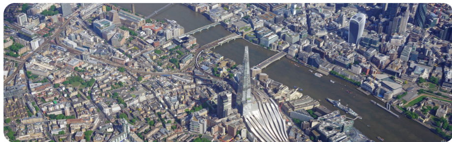
Aerial view of London

A city is a large, busy settlement where lots of people live and work. A city usually has a cathedral, a river, important buildings and offices where people work. There are lots of things to see and do in a city. There are many shops and restaurants to visit.