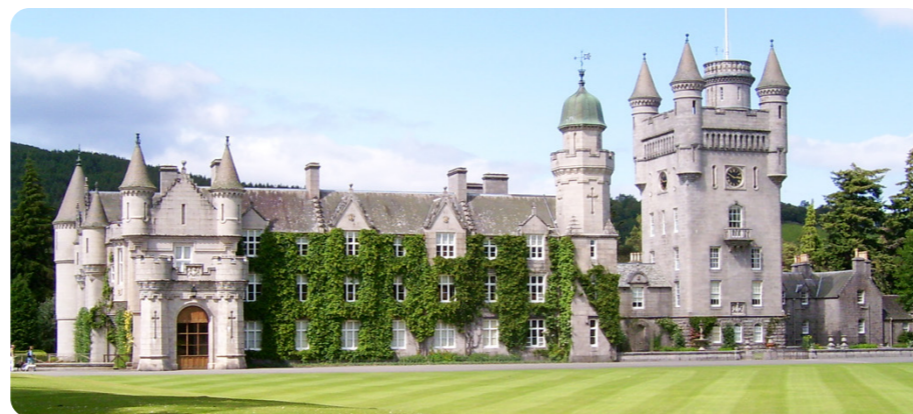
Balmoral Castle is in Aberdeenshire, Scotland.