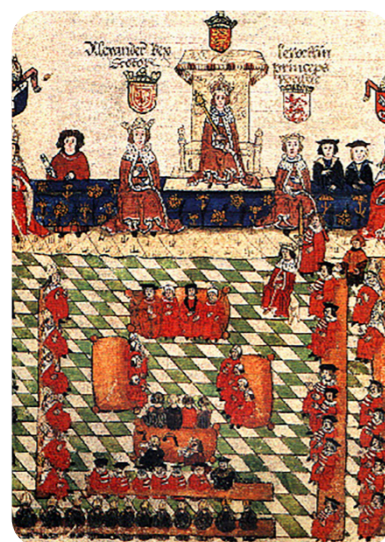
Edward I and the Model Parliament

The power of the monarchy has changed over time. In the past, some monarchs had absolute power. This meant that they could do whatever they wanted. Today, there is a constitutional monarchy. This means that the monarch is controlled by parliament and the government.