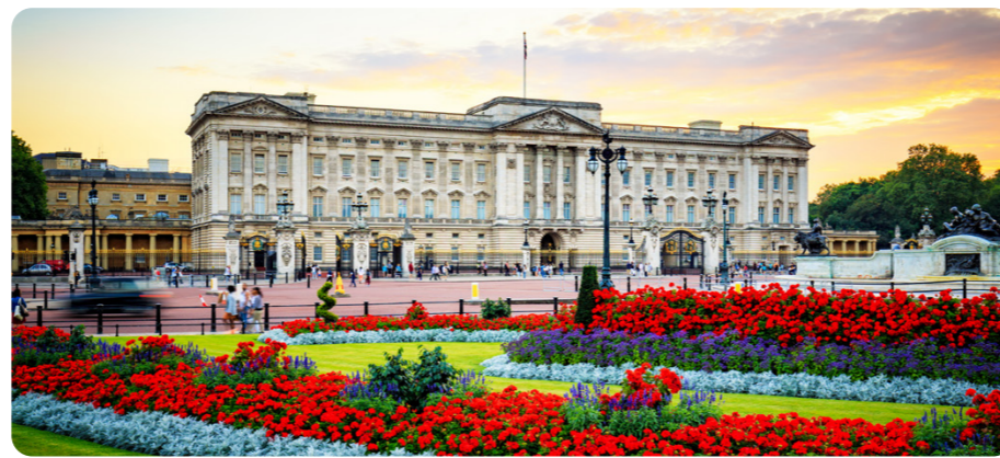
Buckingham Palace is in London, England.

Royal residences include palaces, castles and stately homes. Some of them are used for official royal business. Some are used as holiday or private homes. Many are tourist attractions.