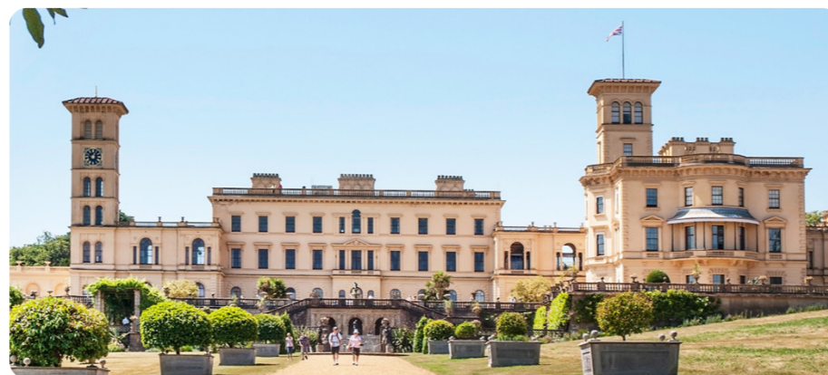
Osborne House is on the Isle of Wight, England.