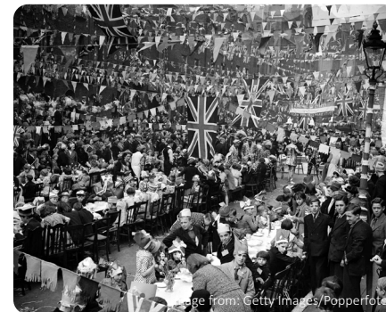
Street party to celebrate the coronation.