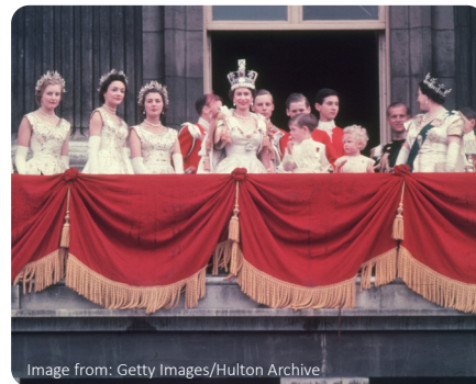
Queen Elizabeth II on her coronation.

A coronation is a ceremony where the crown is placed on the head of the new king or queen. Elizabeth II is the Queen of the United Kingdom. The coronation of Elizabeth II took place on 2nd June 1953 at Westminster Abbey, London. Many people celebrated the coronation by holding street parties.