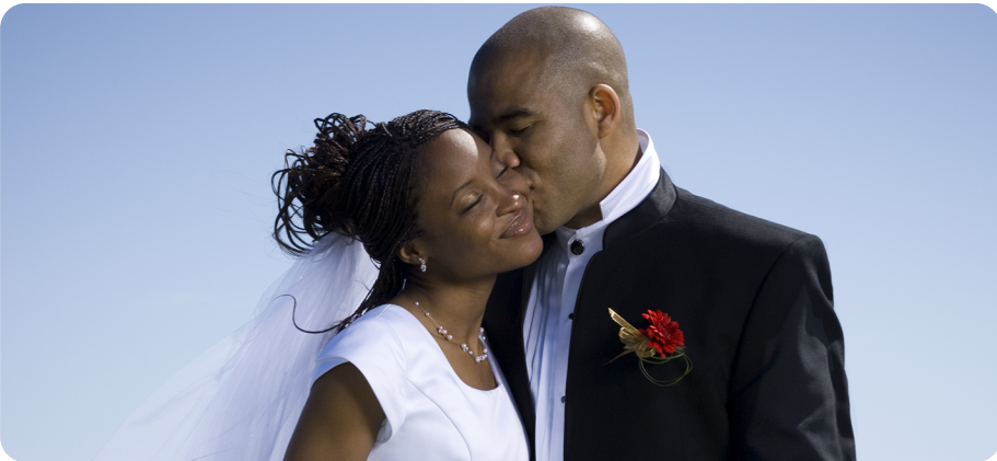
Weddings happen when two adults get married.