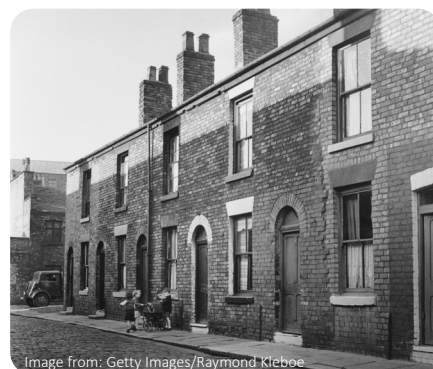
A street in the 1950s.

The way people use land changes over time. For example, in the 1950s there were fewer cars, so fewer roads were needed. Today lots of people have cars, so there are many more roads for people to drive on and driveways for parking.