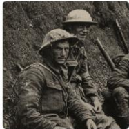
Britain at War