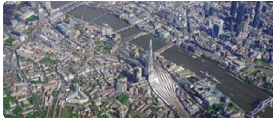
Aerial view of London

A city is a large, busy settlement where lots of people live and work. A city usually has a cathedral, a river, important buildings and offices where people work. There are lots of things to see and do in a city. There are many shops and restaurants to visit.