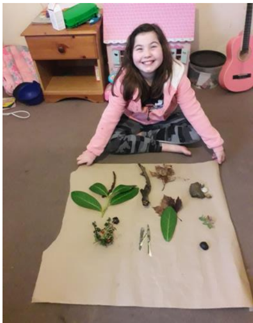
India's forestry work