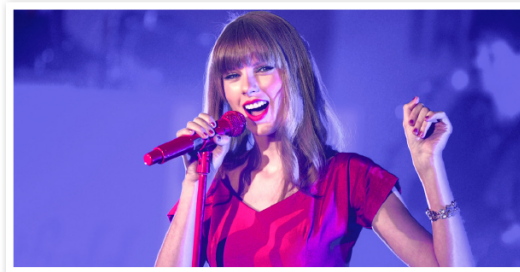
Taylor Swift is a pop and country music singer

Country music came from the southern United States. It often tells a story accompanied by string instruments, such as banjos, guitars and violins.