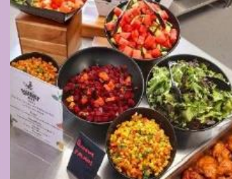
Chinese Vegetable Noodles